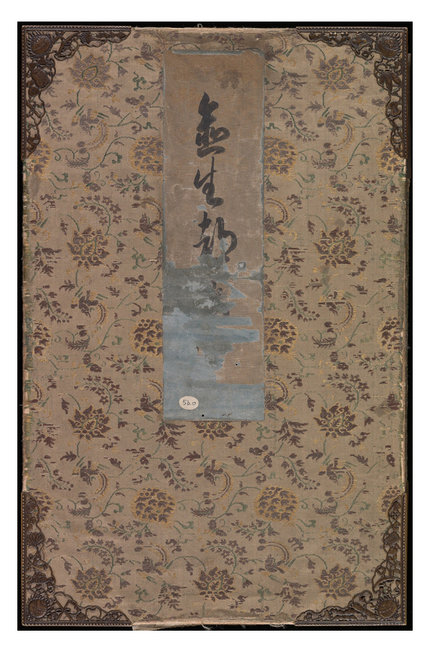
FIGURE 1. Front cover of the Tekagamijō. Note the indecipherable inscription, floral textile design, and elaborate brass fittings. "5b.a" is the original Yale Association of Japan cataloging number.

presumably profitable market demand. In these waning years of the first quarter of the twenty-first century, there are no doubt many who would feel much the same; and yet, we live and work in a time and place that may prompt us to think about fragments, fragmentation, as well as heritage and their uses and abuses in yet other ways. Shimizu and Rosenfield's phrase "old calligraphy fragments" quite literally renders the Japanese term for the corpus of materials from which the content of tekagami was culled: kohitsugire 古筆切—that is, old ( ko ) ink-brush writings ( hitsu ) that have been cut up ( -kire ).