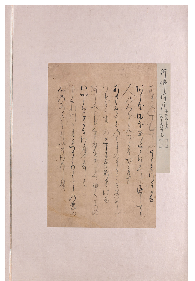
FIGURE 9. Tekagamijō panel ura 63: "Abutsu Zenni. Tameie-kyō no musume [sic]. Ama no sumu tefu"

by and large they are words that have long been in motion and have previously been captured and anchored within other poems, but that remain free to be recaptured and reanchored in new ones, over and over and over again; and by virtue of having been used in poems previously, they become the matter that will and must be used again in just this way. I bring this up not just because poem texts predominate in the content of tekagami text samples, but rather to offer one final structural analogy. For, like the anthology, the harimaze screen, or for that matter the eclectic museum that strives to be encyclopedic or to tell its own special story (as in the Barnes or Kettle's Yard), the Japanese poem is a space—admittedly a rather modest, small-scale one—into which resonant, prized materials are loaded, having been seized, or caught in mid-motion as it were, on the way from wherever they have been (in other poems) to wherever they may be going (into other poems ad infinitum).