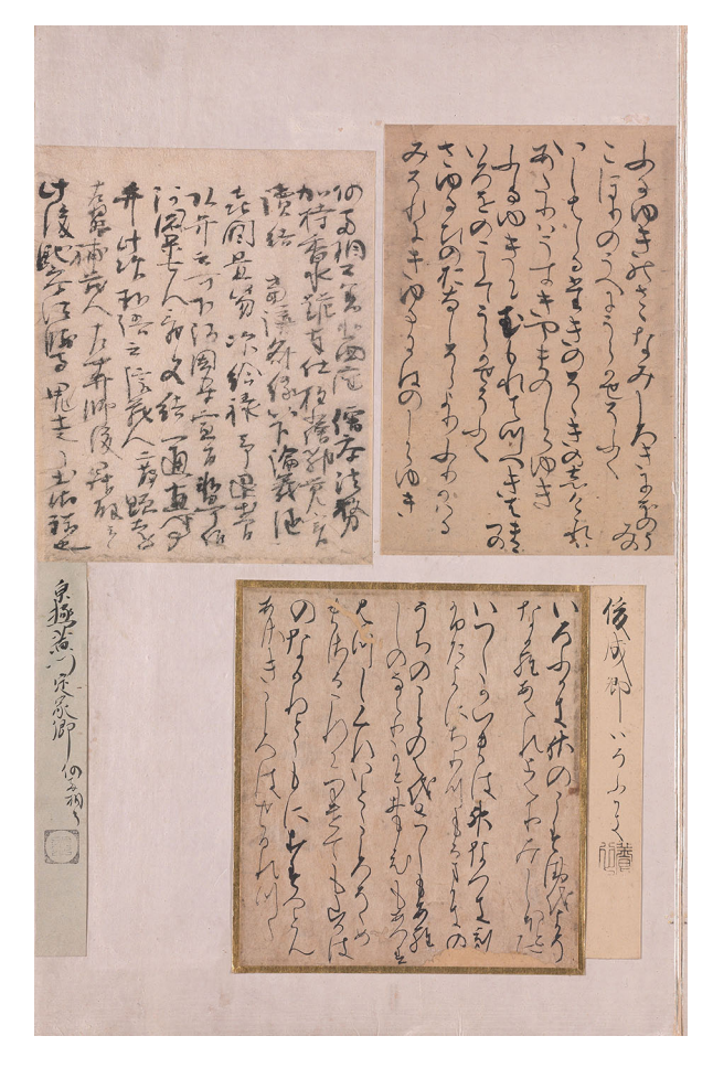
FIGURE 10. Tekagamijō panel ura 43: "Shunzei-kyō, ' iro fukaku '; Kyōgoku Kōmon Teika kyō, nao ryōshōkō"

chapters of love poems ( koi no uta 恋歌) in the Kokin wakashū 古今和歌 (poems 816–20); but a close look reveals that the sequence is broken at its outset: the first three five-beat lines ( ku 句) of the first poem are missing, while the remaining four poems are whole. Thus: