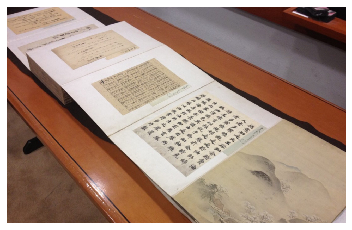
FIGURE 3. Tekagamijō, ca. 1670. Accordion-style album; 1550 x 39.4 cm. Yale Association of Japan Collection, Beinecke Rare Book and Manuscript Library, Yale University

Although the Tekagamijō contains more calligraphy samples than some smaller albums but fewer than others (compared to 298 in the Metropolitan Museum of Art's Mokagami and 319 in the Oregon album), it does share the basic internal organization of contents common throughout the genre—that is, the accordion-style structure (samples are pasted on both sides of each board; the entire volume must be turned over in one direction or the other in order to see all of its contents) and the grouping and sequencing of samples according to a wellestablished hierarchical pattern that begins with royal sovereigns and consorts, and continues with other categories of persons of note for various cultural accomplishments-not only calligraphy. (See table 1.) The Yale album also shares with other outstanding examples such distinguishing features as the fine (if quite worn) quality of its cloth covers and decorative metal protectors affixed to the corners of those covers, and the affixation of landscape paintings on the inner surface of the album's front and back covers. (In the Tekagamijō, these bear the signature of the court painter Kanō Masunobu 狩野益信 (1624-1694) (fig. 4). The presence of such features, as noted by the book historian Sasaki Takahiro 佐々木孝浩 and others, is an indication that the patron for whom the album was assembled was likely to have been a person of considerable wealth.<sup>14</sup>