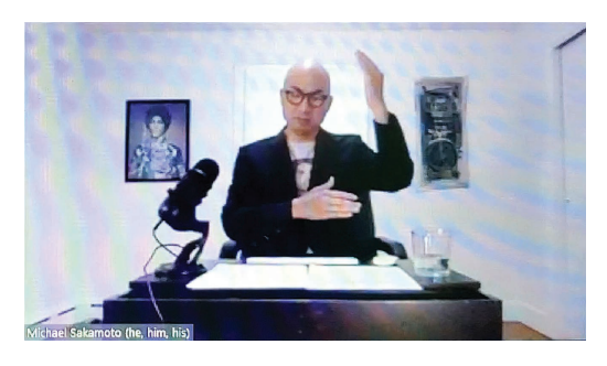
Performing virtually for the AAP Conference 2021.

And somehow, I was attracted to that. Somehow, as an Asian American, it all felt familiar. Being able,