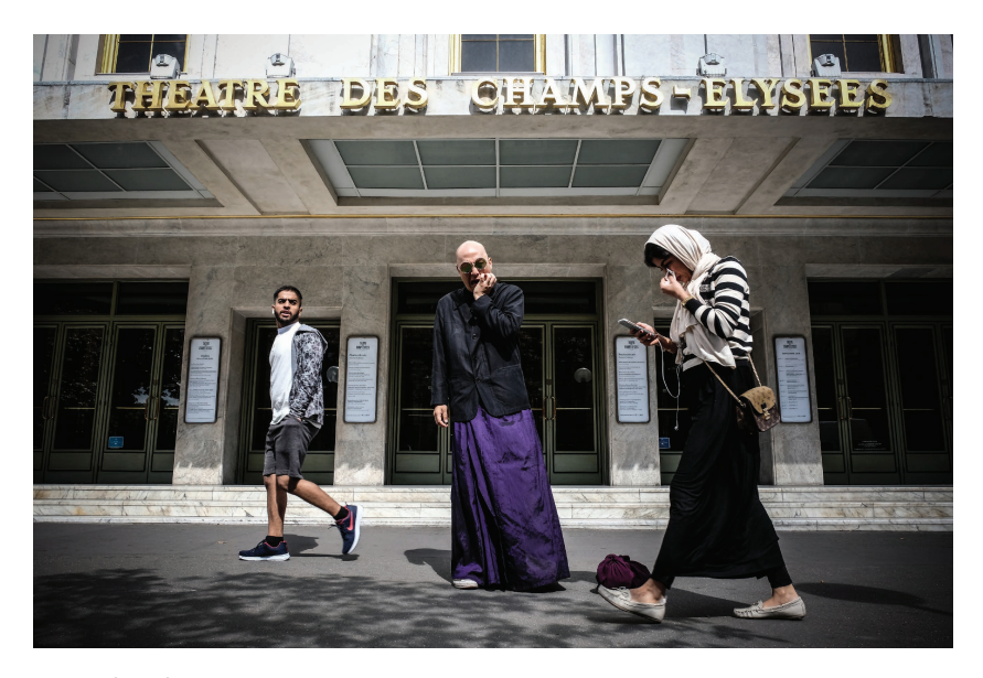
From the photo series, MuNK, Paris, France (2018).