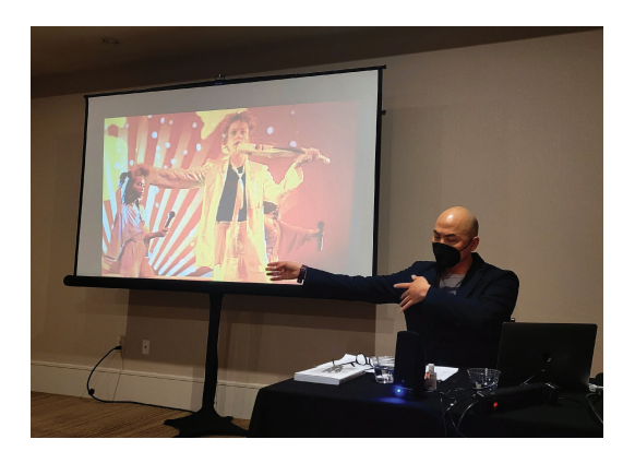
Performing at the Association for Asian American Studies Conference, Denver, CO, 2022.