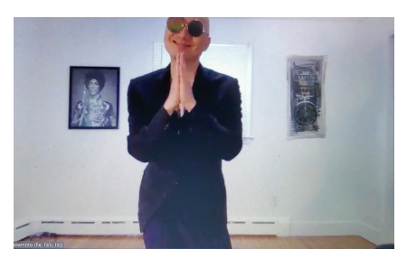
Performing virtually for the AAP Conference 2021.