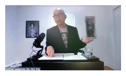
Performing virtually for the Association for Asian Performance Conference, 2021.

. . .Truth is, as a young, aspirational, Asian American artist, I'd thought about these things—Who am I to complain? What is my place? Where is my lane?—starting as a college art student looking for inspiration;