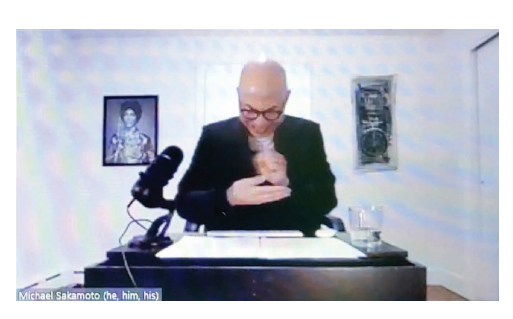
Performing virtually for the AAP Conference 2021.