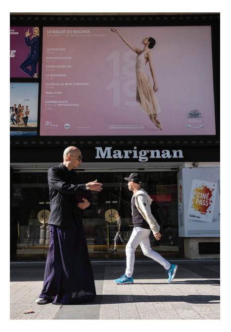
From the photo series, MuNK, Paris, France (2018).

says it would help our case to claim a global dance technique curriculum, despite the departure of the only two faculty who taught it. In response to another faculty of color and me pointing out that this would be a false claim, they say that the fact that "we aspire" to such curriculum is enough.