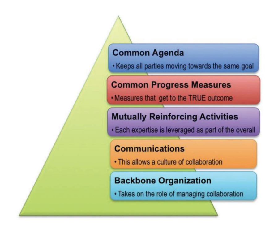
Figure 3. Collective impact elements (Collaboration for Impact, 2018).

With these components, CI initiatives are situated to holistically address intractable issues, such as homelessness. In particular, CIs can center equity if and when they ground the work in data and targeted approaches, focus on systems change in addition to programs and services, shift power, listen to and act with community, and build leadership and accountability (Williams, 2022). With these principles, SI