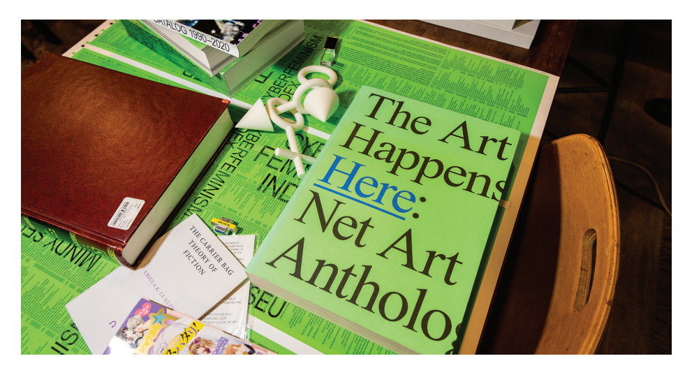
FIGURE 7: A close-up of the table of object influences at Pioneer Works for the Cyberfeminism Index book launch on December 11, 2022.