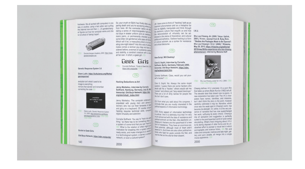
FIGURE 3: A spread from Cyberfeminism Index .

LC: I think we rarely see such an aggregate recording of web activity told mostly through the artists' own words. The index form is powerful in this regard—it shows more than it tells. The book is also framed with beginning and ending essays, and includes a section called "Collections" that is a compilation of curated walkthroughs or tours of the book by various artists and scholars. In this way, the book is a hybrid of text and index.