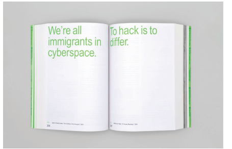
FIGURE 4-5 : Spreads from Cyberfeminism Index .