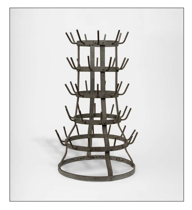
Figure 2. Bottle Rack, by Marcel Duchamp (1914/1959)

physical structure.<sup>24</sup> Any organization involved was merely a matter of choosing how they would be presented within a gallery setting. And yet these works are widely accepted as instances of visual art.<sup>25</sup> So, assuming—plausibly—that visual art involves similar organizational requirements with respect to its physical materials, parity of reasoning suggests that musical appropriations do not require (potential) modifications of the physical structure of elements of the work to satisfy the organized sound condition.