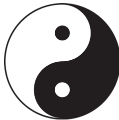
Figure 2. The Diagram of Taiji 太極圖