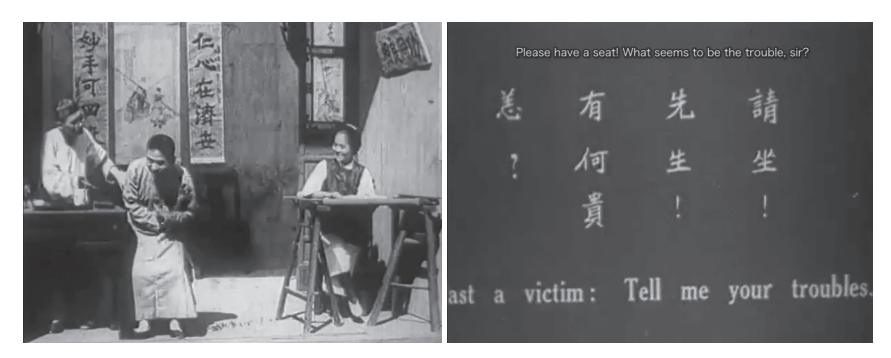
Figure 3: "At last, a victim!" (but only in English), in Laborer's Love (1922).

In silent films containing original Chinese and English bilingual title cards, I retranslate the Chinese when the meaning of the original English differs from the Chinese or is archaic, incomplete or misleading. In some cases, the original translator made a deliberate move to render the English differently than the Chinese, as when a man arrives at a clinic in Laborer's Love and the doctor says, "At last, a victim!" (The "victim" turns out to be not a patient but a con man; see figure 3.)