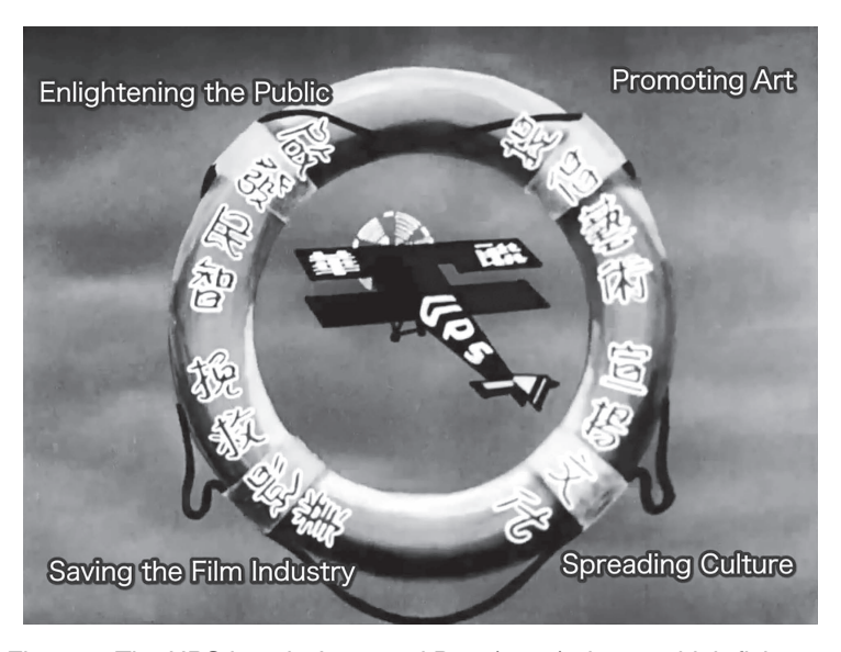
Figure 5: The UPS logo in Love and Duty (1931) shows a high-flying company offering a life preserver to the Chinese film industry, surrounded by four corporate slogans.