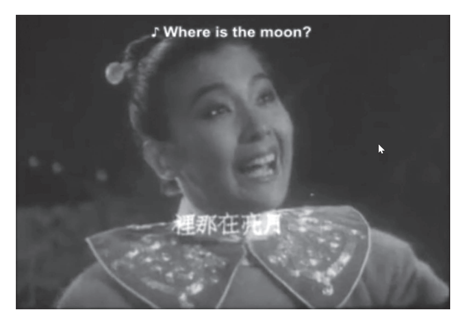
Figure 1: Mulan singing in Hua Mu Lan (1939).

that a key element of their storytelling is unavailable to people without Chinese proficiency. While working on Chinese Film Classics , 1922–1949 (Columbia, 2021), I began translating Republican-era films. So far, I've translated twenty films and edited five other translations, my goal being to make these films not just accessible and comprehensible but engaging. This essay explores how multiple types of global storytelling—by filmmakers, translators, educators, students, and the public—have intersected in the ongoing experiment that is the Chinese Film Classics project.