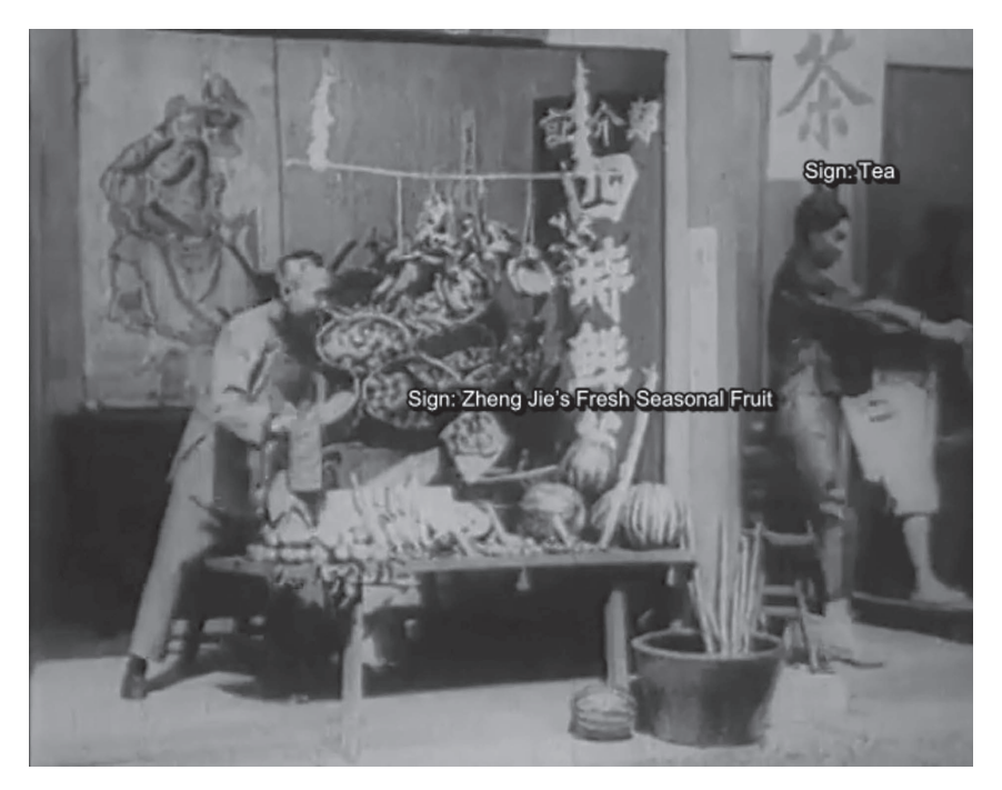
Figure 2: Shop signs in Laborer's Love (1922).

to render 1927 speech in 2021 vernacular could result in anachronism. Finally, how to fit all of the text into the frame without occluding the original image?