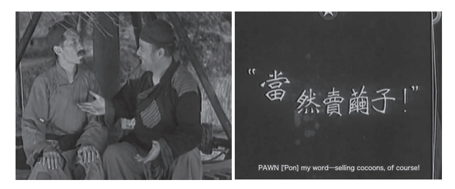
Figure 6: Font design and placement in the title cards highlights significant phrases in the title cards of Spring Silkworms (1933), including this pun "PAWN ['Pon] my word—selling cocoons, of course!"

Spring Silkworms (Chuncan, 1933), adapted from the Mao Dun story, represents all dialogue and narration in title cards and emphasizes key terms by rendering them in larger font or with special placement: PAWN, MONEY, HOPE, FEAR, FATE. The result is a stylized effect that mimics "louder" sounds visually and exaggerates allegorical meanings. At one point in the dialogue, a friend asks the lead farmer "Tongbao, will you be selling cocoons or spinning silk at home yourself?" The larger font draws attention to a pun on a key word in Tongbao's response, which I rendered in figure 6.