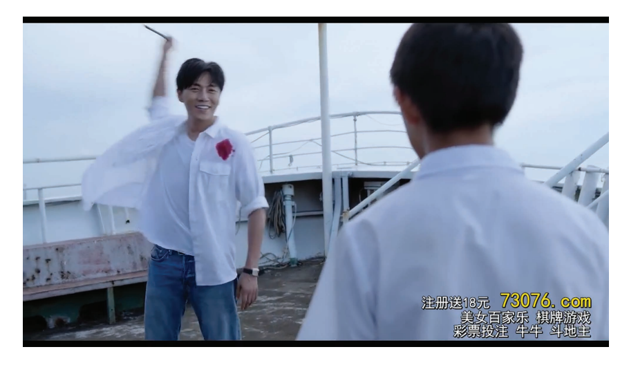
Figure 2: The murderer Zhang Dongsheng about to be slain in episode 12 of The Bad Kids .

knowledge—Zhang tempts Zhu to follow his own path of violence, to become, as Yan Liang warned, "the second Zhang Dongsheng." If love and its fruits of children are out of reach, hate satiates the human need just as well for physical contacts through clashes of bodies. The fruits of hate hemorrhage into rotted body parts and tormented souls, both in denial of the finality of death. Maggots emerge from wounds, murders from a diseased heart—both filling the void of mortality.