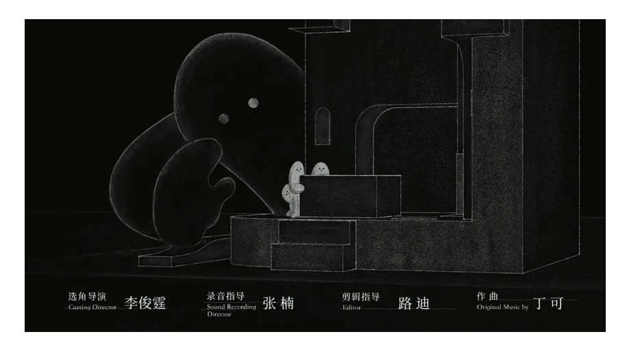
Figure 1: Three little ghosts chased by a big one in the opening credits to The Bad Kids.