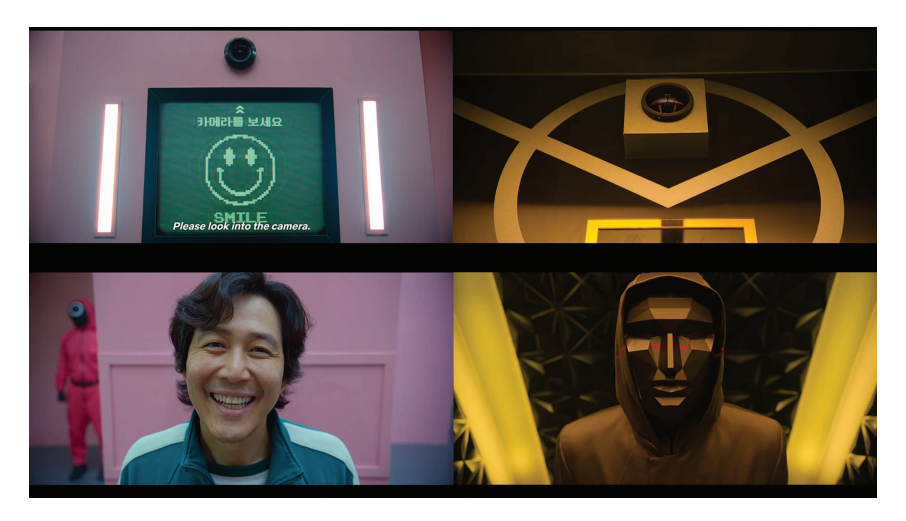
Figure 4: The posthuman intimacy between automatic machines and humans

viewing whom in a machine-human relationship, thus evoking an uncanny feeling. Some of these shots are closely spaced during the last twenty minutes of the first episode, which is a sequence of parallel editing between the players and the front man. One of the most memorable parallels is between two shot/reverse-shot sequences one between Gi-hun and the camera at the self-service registration kiosk; the other between the front man and the door camera with a facial recognition security system (Figure 4). Conventionally, a sequence of over-the-shoulder shots/reverse shots are often used to create an emotional connection between two characters who are engaging in a conversation. As the camera alternates from one character to the other, the audience is supposed to empathize with both. In contradistinction, the shot/reverse-shot sequences here do not occur between two human or anthropomorphic characters but between people and impersonal machines. The POV shot of an automatic machine looking at a person provides a unique, nonanthropocentric perspective. The effect is a kind of posthuman intimacy,