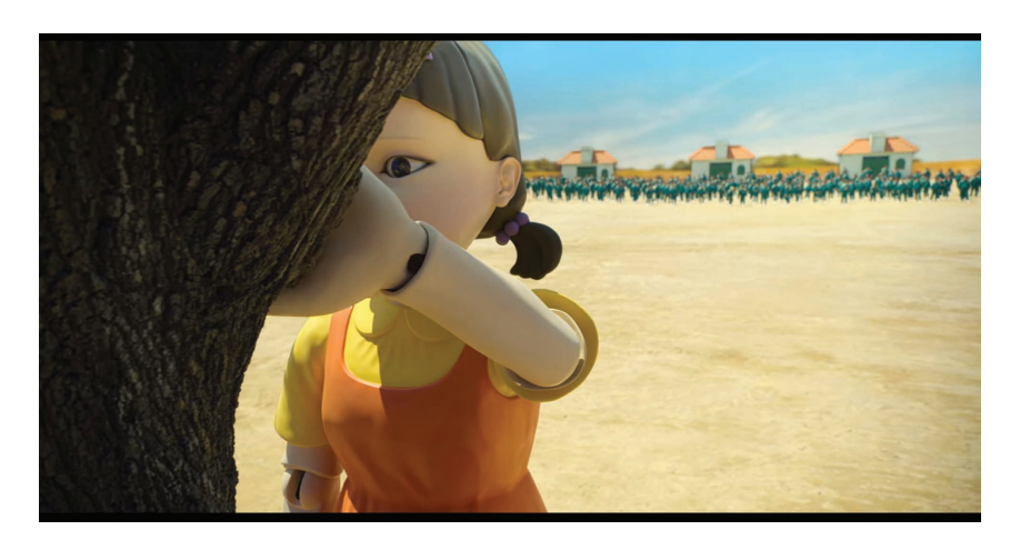
Figure 1: The iconic doll

companies, and local businesses have been swift to capitalize on its success, from themed cafés in Paris and Chengdu to replicas of the massive robot doll in Manila and Sydney, from a Minecraft live-stream attracting 200 participants to play together to hourlong immersive adventures provided by Immersive Gamebox in the US, UK, Germany, and United Arab Emirates.