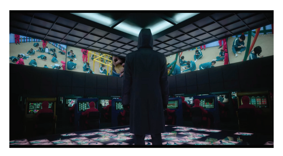
Figure 3: The control room as a hall of screens

message even more strongly, as the magnified point of view (POV) puts the audience directly in the position of a VIP looking through binoculars.