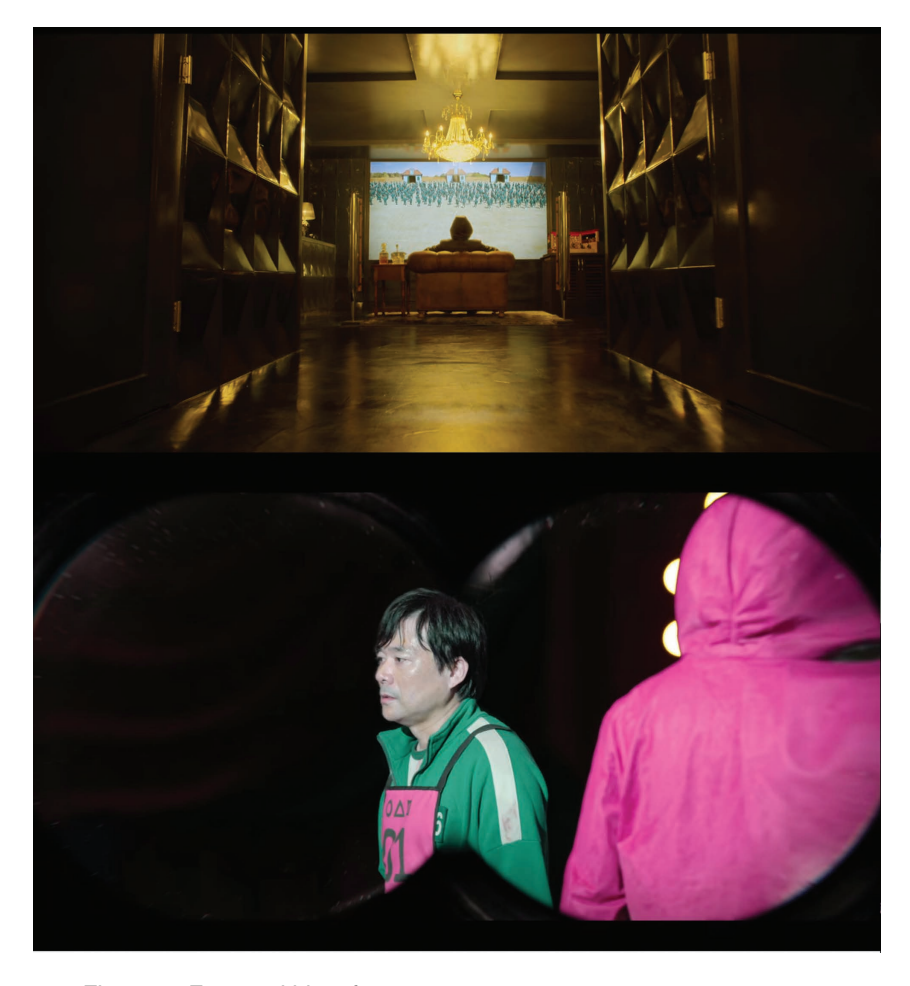
Figure 2: Frame within a frame

of drawing attention to the act of observation itself. In the top image, the viewer is positioned down the hall behind the front man as he monitors the contestants. The shot is a reminder that the very act of watching, regardless of sitting in a surveillant's lounge or at home on the couch, entails a certain degree of voyeurism. The bottom image from episode 7 conveys this