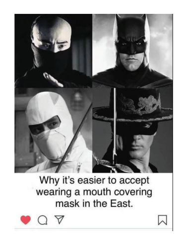
Figure 6: Move masks in the East and West. Source: Dou Wanru, "Niuyue yiqing riji—Xiaodou: 'Wo ma bu shi yonglai xisheng de, ni ma ye bu shi'" 小豆:「我媽不是用來犧牲的,你媽也不是」

[Little Bean: "My mom is not a homo sacer, nor your mom"], WeChat,