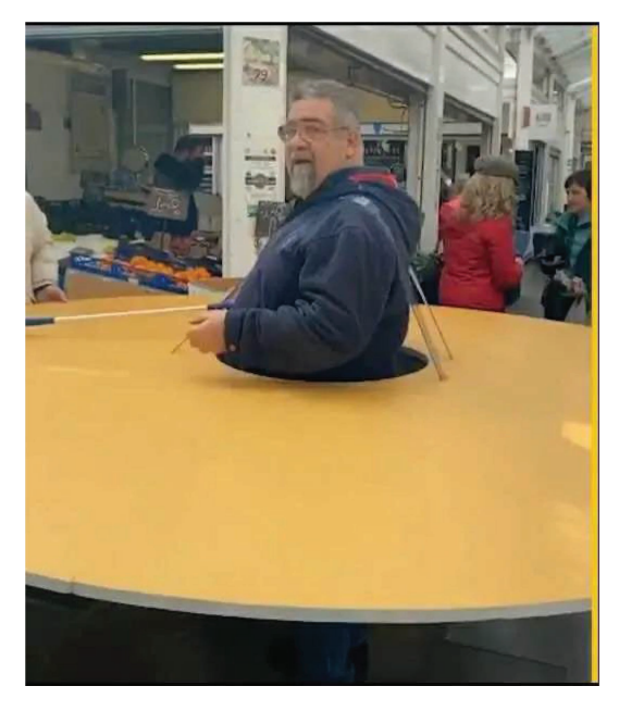
Figure 3: Italian social distancing.

When LanLan visited her daughter at Princeton University in mid-March 2020, they saw a student posting two huge farewell notes on the dormitory window as if it was doomsday: "Come by & say hi for the last time." The college student intentionally used the scurrilous subculture of foul language, a common comic practice, to undermine the superstructure of the school administration that decided to shut down the campus.