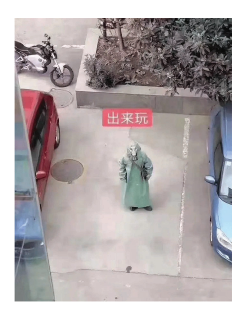
Figure 7: "Hang out."

by outwardly claiming absolute belief, implies absolute denial."<sup>38</sup> Ai denied the official "good news" and refused to eulogize crackpot policymakers.