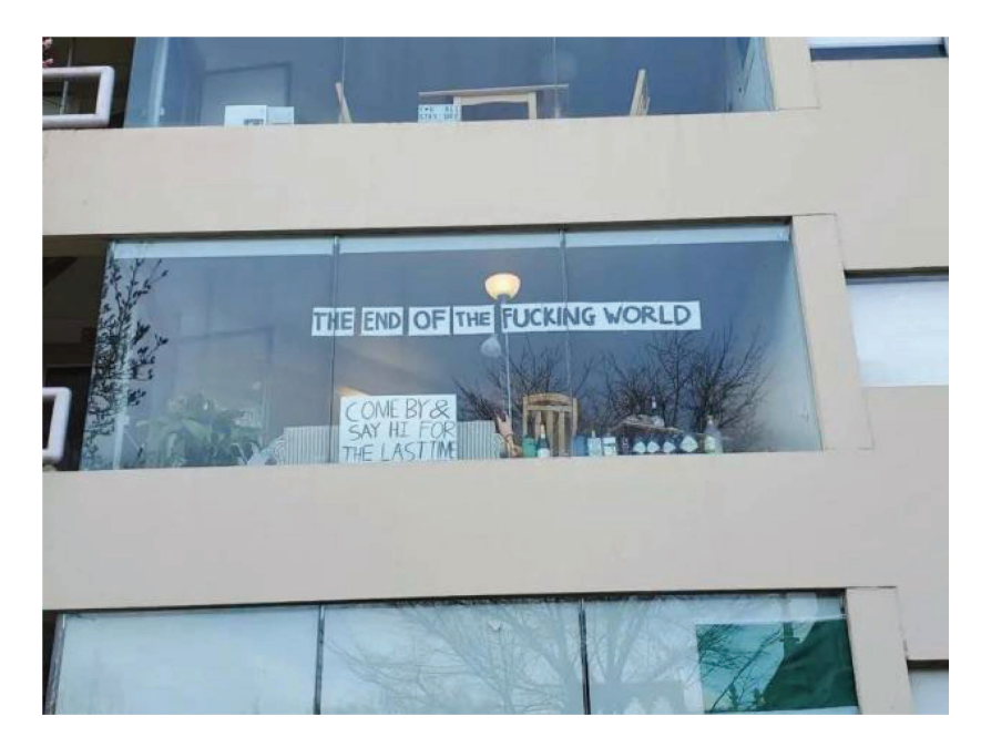
Figure 4: Campus windows on Princeton University.

States—such as labelling COVID-19 the "China virus" by Trump—Wang wrote the following wording on her mask when she went out grocery shopping (see figure 5).<sup>23</sup> The four white words on the black mask denote a droll declaration against discrimination, which is revived by the virus or, more precisely, in the name of the virus. The surgical mask now has value beyond its medical function, a "surplus value" beyond Karl Marx's political-economic imagination.