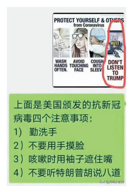
Figure 10: "Protect Yourself & Others from Coronavirus."

presented by Donald Trump, the forty-fifth president of the United States from 2017 to 2021: "Protect yourself & others from coronavirus: 1) wash hands often, 2) avoid touching the face, 3) cough into the sleeve, 4) don't listen to Trump." Since Trump advised people to treat COVID with Dettol, Dou borrowed in her diary the words attributed to Hillary Clinton from