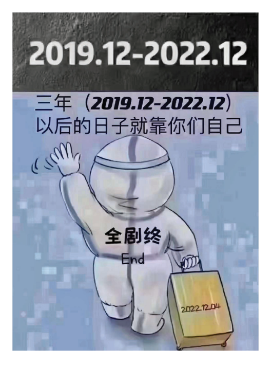
Figure 1: December 2019 to December 2022.

This is just one of a multitude of literary genres and media forms that indicate common discontent in China. Online diaries, jokes, webtoons, short videos, memes, deepfakes, and the recent "mad literature" ( fafeng wenxue 發瘋文學) have all used humor and satire as safe entries into and exits from communist censorship.³ People complained that three years had been wasted in quarantine camps, sealed buildings, city lockdowns, closed borders, mobility restrictions, contact tracing, digital surveillance, and PCR tests instead of medical preparations such as mRNA vaccination and ICU and hospital expansions. While a few funny digital artworks were misleading about COVID-19 vaccines or functioned as patriotic political propaganda,