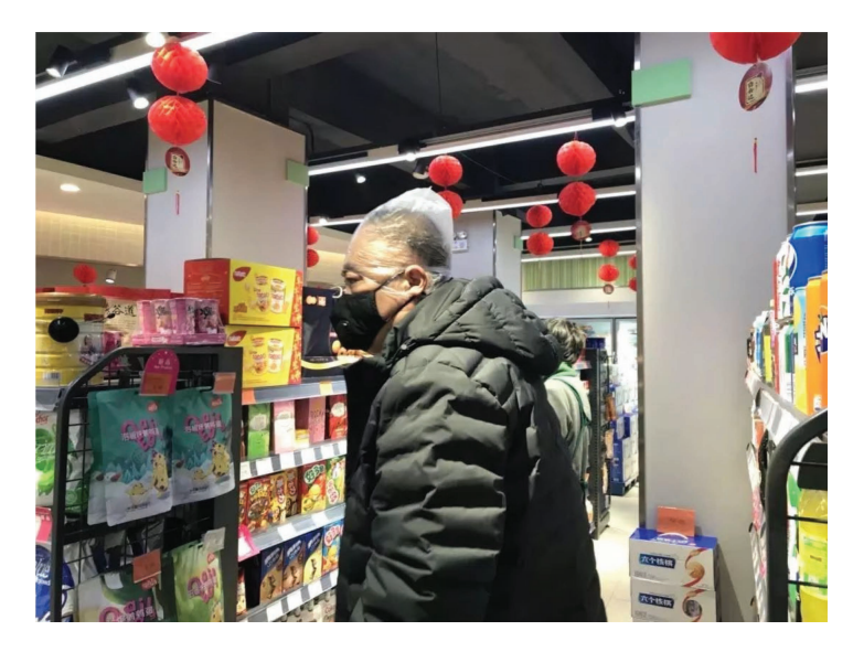
Figure 2: Corner store shopping during the pandemic.

(anshenyao 安神藥).<sup>19</sup> Her writing was soothing, infused with amusing images. With COVID becoming a global crisis, the world was in despair. LanLan included in her blog a big Italian guy who maintained his social distance by putting on a yellow disc one meter in diameter (see figure 3):<sup>20</sup>