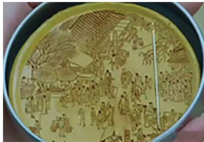
Figure 4: Fan photo-edited Riverside Scene at Qingming Festival on a Dalgona.