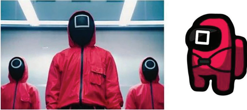
Figure 1: Left: The square guard from Squid Game . Right: The character skin designed by fans in Among Us .

introduction in the “Data Visualization and Discussion” section, topics including “plot breakdown,” “character cut scenes,” and “plot remixes” are considered directly relevant to the plot and characters of the series. Videos featuring interviews, offline decoration, and spin-offs are considered adjacent to the core text. For instance, although dialogues and scenes from the series are included in videos classified as “fan dubbing and sound effects,” they are in decontextualized segments that cannot contribute to the understanding of the plot or characters and are therefore categorized as “adjacent to the core text.” Examples of elements retrieved from the core text include the numbered green sportswear worn by players in the series, the masked guards, and the Dalgona (달고나, “honeycomb toffee”). Engaging with these elements, fans produced video games imitating the Red Light, Green Light game, designed player skins in the multiplayer video game Among Us , and made recordings of making and playing with Dalgona.