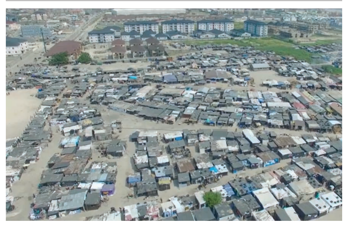
Figure 6.2: The Ghost and the Tout : an establishing shot contrasts the "ghetto" with its affluent surroundings.