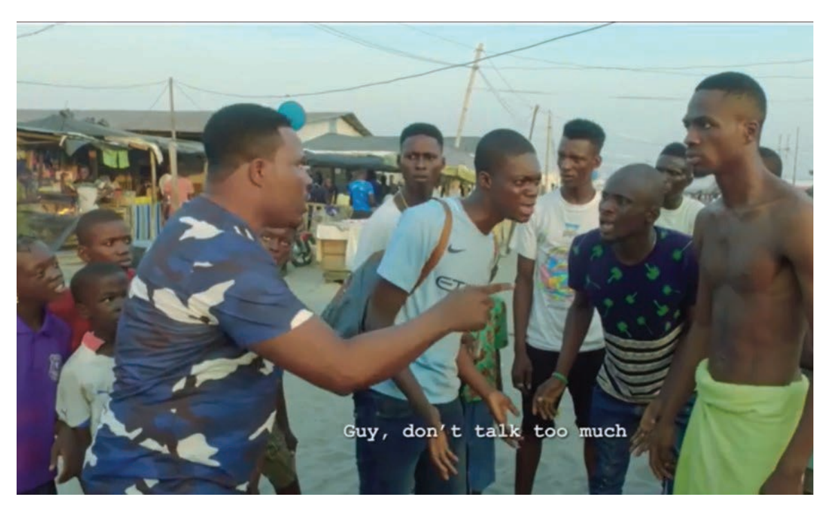
Figure 6.3: The Ghost and the Tout : the slum is prone to chaotic eruptions in voluble Pidgin.