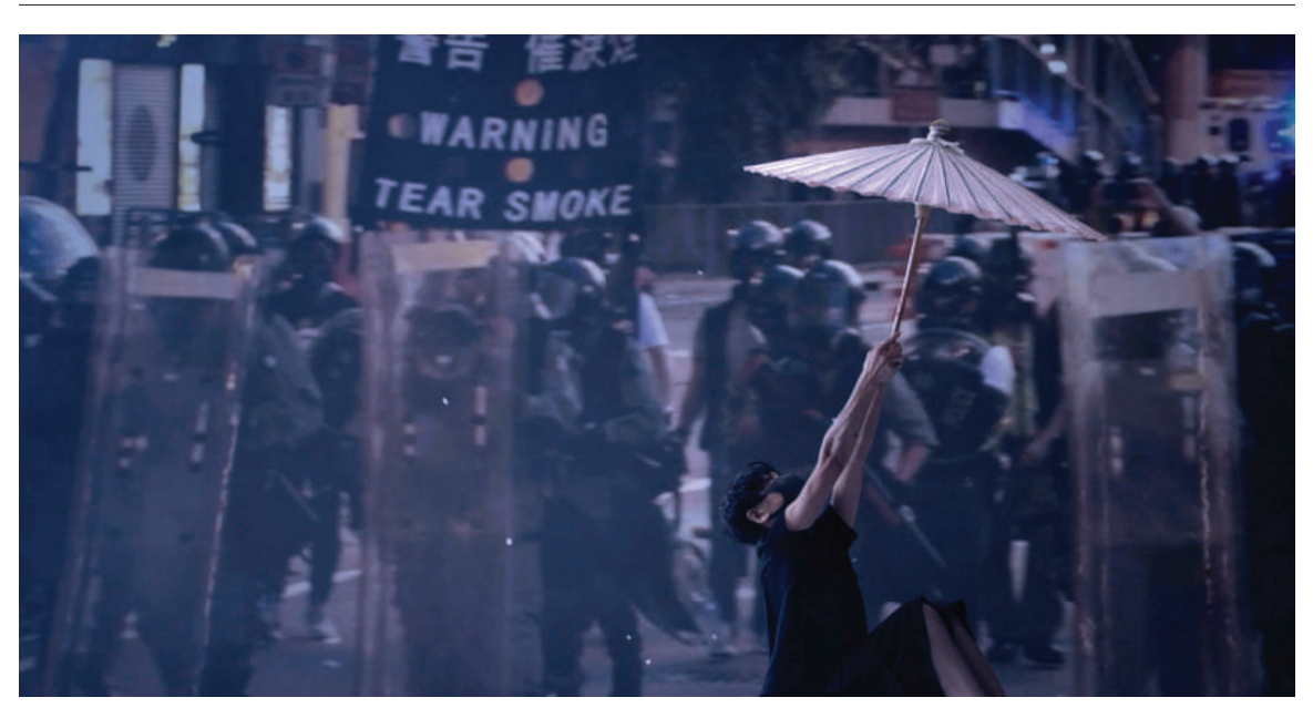
Figure 2.4: Still from King Fai Wong, Umbrella Dance for Hong Kong.