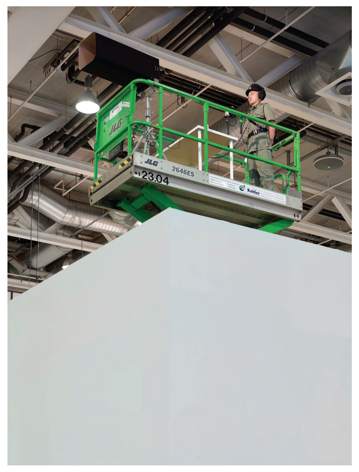
Figures 2.8: Samson Young, Canon , 2016. © Samson Young. Image courtesy of the artist, Edouard Malingue Gallery, Galerie Giesla Capitain and Team Gallery. Photo by Simon Vogel.