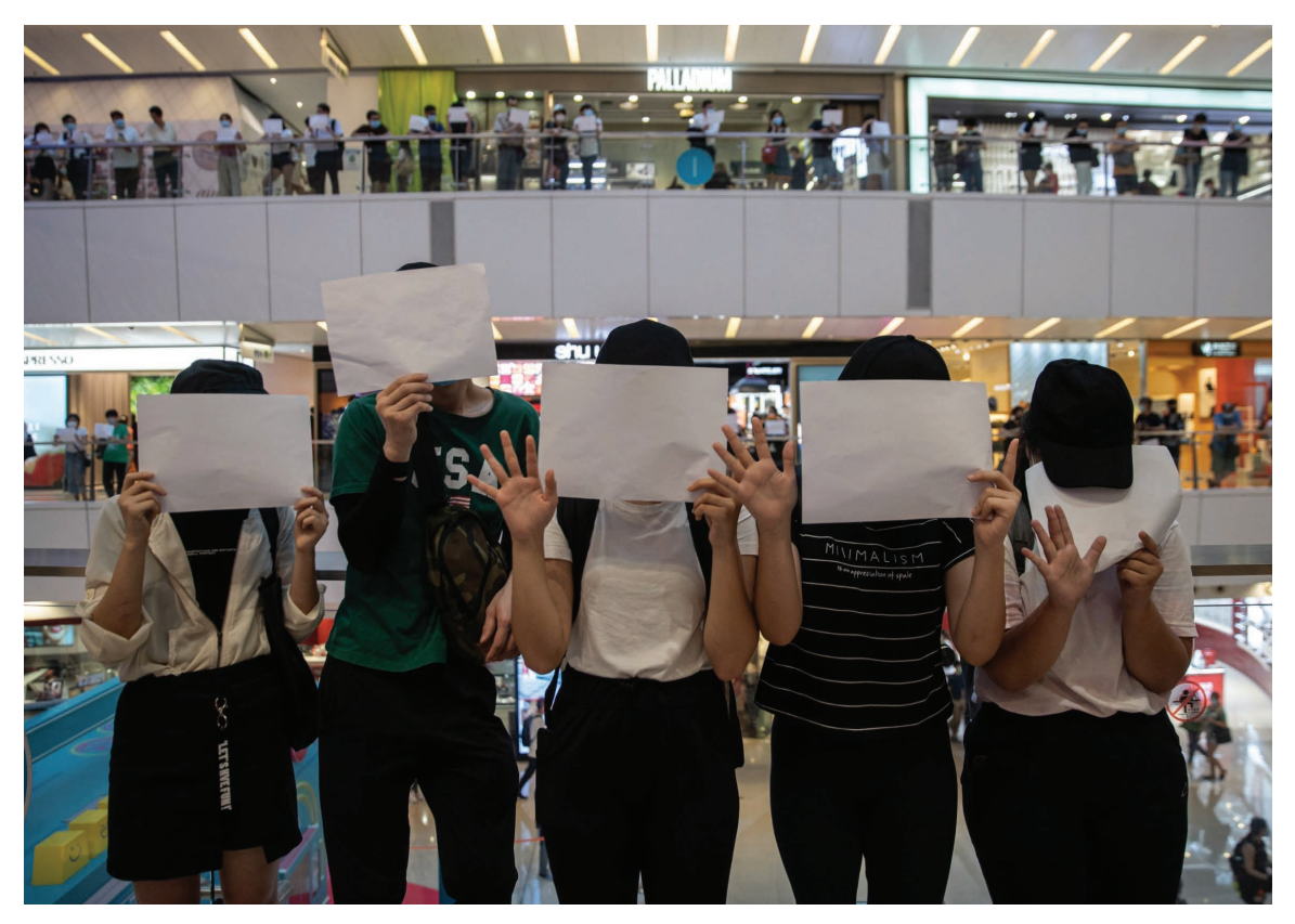
Figure 2.1: Protesters hold sheets of white paper during a protest in a Hong Kong shopping mall on July 6, 2020.

of the joint declaration granting the city political and legal autonomy until 2046.<sup>4</sup> Since January 2020, independent media diagnosed a fading out of protest vigor in the city upon the dispatch of new liaison office head Luo Huining, the Covid-19 outbreak, and the security law resolution. Despite these endgame calls, local activism goes on. It is changing dramatically, though, as Lisa Lim recently summarized in her description of the citizens' turn toward symbols and performative acts meant to expose the growing walls of government-imposed silence. Lennon Walls with empty Post-It stickers across the territory, pictures of groups of protesters with blank sheets of paper covering their faces, and icons on graffiti and social media platforms testify to Beijing's silencing policy, she argues. In her view, "Such erasure amplifies the message, giving voice to both what is being censored and the act of censorship"<sup>5</sup>.