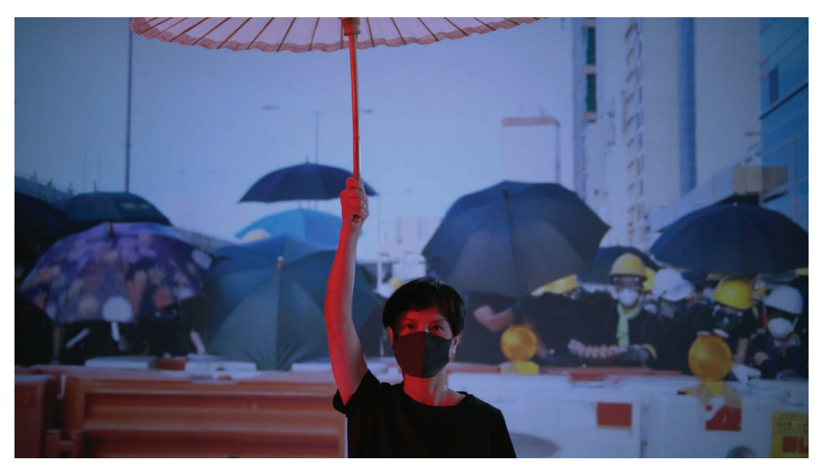
Figure 2.6: Still from King Fai Wong, Umbrella Dance for Hong Kong , 2019.

Sonic artist Samson Young, in his multimedia art installations, addresses the contradictions of protest art by actively involving audiences in the performance.<sup>46</sup> His compositions foster critical reflection by means of foregrounding the hidden ideological operations of music and seek social reconciliation by working with the members of oppositional political factions. For his 2017 Venice Biennale creation Songs for Disaster Relief ,<sup>47</sup> he invited the Hong Kong Federation of Trade Unions' (HKFTU) Kwan Sing Choir to take part. Though belonging to the pro–Beijing camp, the HKFTU choir eagerly agreed to coproduce Young's muted rendition of the charity song "We Are the