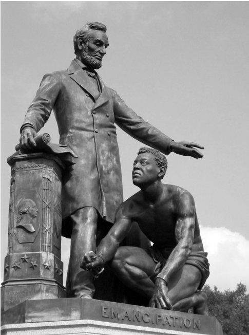
Figure 3. Thomas Ball, Freedom's Memorial (Emancipation Group), 1876. Bronze. Lincoln Park, Washington D.C.