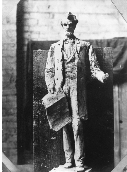
Figure 6. Augustus Saint-Gaudens, Clay sketch for Abraham Lincoln: The Man (Standing Lincoln) , 1885, destroyed.

This anecdote, in addition to providing a fascinating glimpse of Saint-Gaudens's powers of concentration, also confirms a central point of this article: the importance of plaster reproductions of ancient works for the artist in the design of the Standing Lincoln monument. As we will see below, he turned to these objects, much neglected in recent scholarship, when he was working out the appearance of the figure itself.