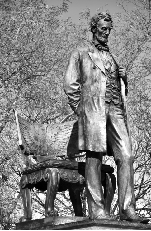
Figure 2. Detail of Figure 1.