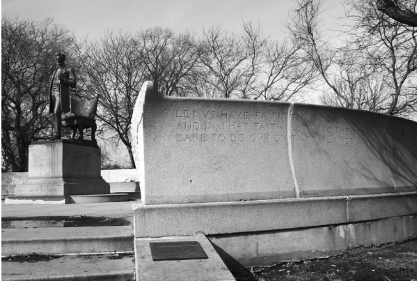
Figure 4. Detail of Figure 1.