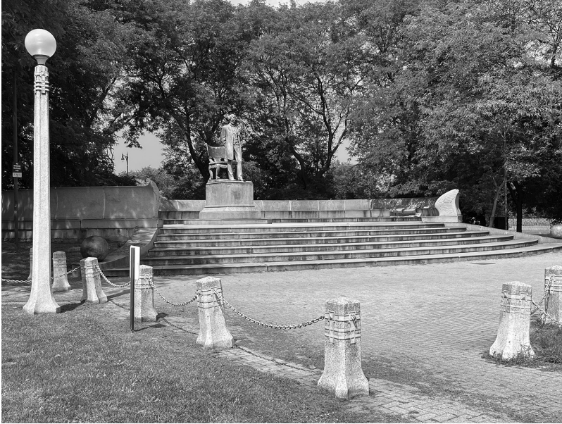
Figure 1. Augustus Saint-Gaudens, Standing Lincoln (Lincoln: the Man) , 1884. Bronze. Lincoln Park, Chicago. Wikimedia Commons.

spectrum, for a leader who could bring wisdom and calm to the nation and create a sense of unity.