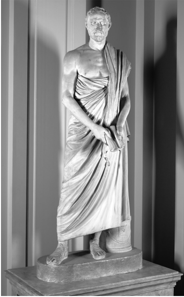
Figure 8. Demosthenes , ca. 1845. Plaster. Boston Athenaeum, Boston, Mass.

moment in contemplation, was about to speak with an authority equivalent to that of the ancients.