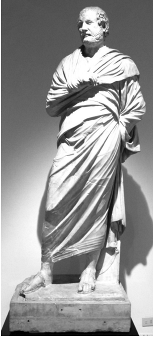
Figure 7. Aeschines, Roman copy of Greek original. Marble. Museo Nazionale, Naples.

with one foot extended forward, one hand holding onto his clothing and, in a rare gesture, one hand hidden behind his back. 33 Neither Lincoln nor Aeschines makes any outward gesture towards the viewer or an imagined audience. Aeschines was known have spoken using a common and understandable style, and said—in a text that Saint-Gaudens and his literary friends might easily have known—that in the time of Pericles (495–429 BCE) “to speak with the arm outside the cloak, as we all do nowadays as a matter of course, was regarded then as an ill-mannered thing, and they carefully refrained from doing it.” 34 Aeschines’s suggestion that a speaker keep his hand in his clothing to prevent an excess of physical gesture parallels the advice of the widely