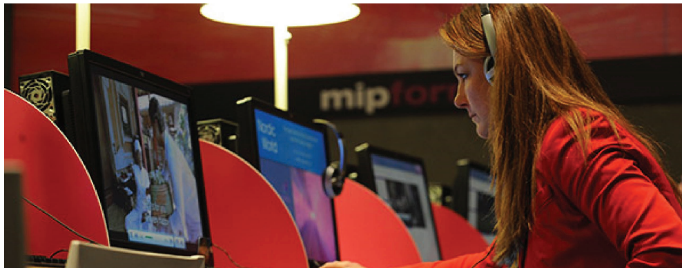
Figure 4. The MIPFormats screenings library.

sales, especially in a meeting between sellers and buyers in a market. In fact, having a sizzle reel is considered best practice for both format and finished program sales. 31 Buyers have limited time for each meeting. The unwritten rule of meetings in the MIPTV market is to spend about five minutes on small talk, about twenty minutes on discussion about projects, and about five minutes for one party—either seller or buyer—to walk to another stand for another meeting. 32 A twenty-minute meeting is not enough time to read format bibles and gain understanding of concepts and format instructions. Even when they have enough time, buyers face enormous risks in determining whether the information presented to them is valuable or not. Rather, buyers desire to gauge the feel and spirit of formats by watching sizzle reels, allowing more efficient, good purchasing decisions. If the buyers are interested in a format, they ask for detailed descriptions and instructions—commonly called the “send after.” 33 This business culture, which is found in the market and repeated in the MIPFormats conference, forces format producers and creators to carry visualized formats—in the form of sizzles—on their laptops or tablet PCs.