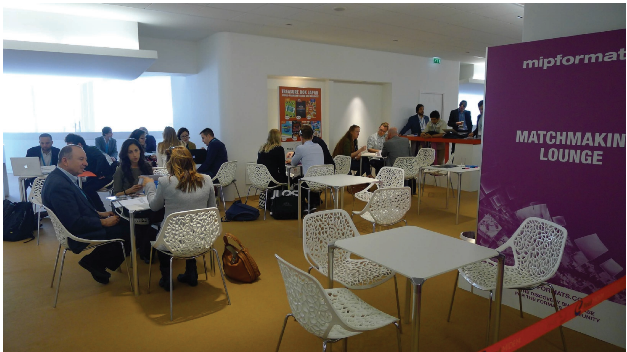
Figure 3. Buyers' Matchmaking session. April 11, 2015.