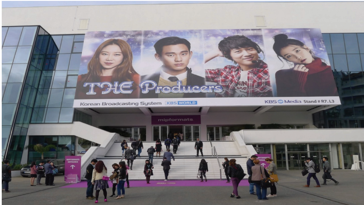
Figure 1. The main entrance to MIPFormats in the Palais des Festivals. Photo by the author, April 11, 2015.

under construction in preparation for the market. Employees were setting up stands, placarding logos on stairs and walls, attaching electronic devices to walls, fixing electric cords on the floors, and so on. MIPFormats' comparatively lesser extravagance can also be observed in the building and the participants' casual clothing. Figures 1 and 2 demonstrate these differences. The staircase to the entrance of the Palais is noticeably simpler for the conference (Figure 1) than for the market (Figure 2). Moreover, due to its larger size, the market requires multiple entrances. The main entrance for MIPFormats was used as an entrance to MIPDigital screenings, which was one minor part of the market.