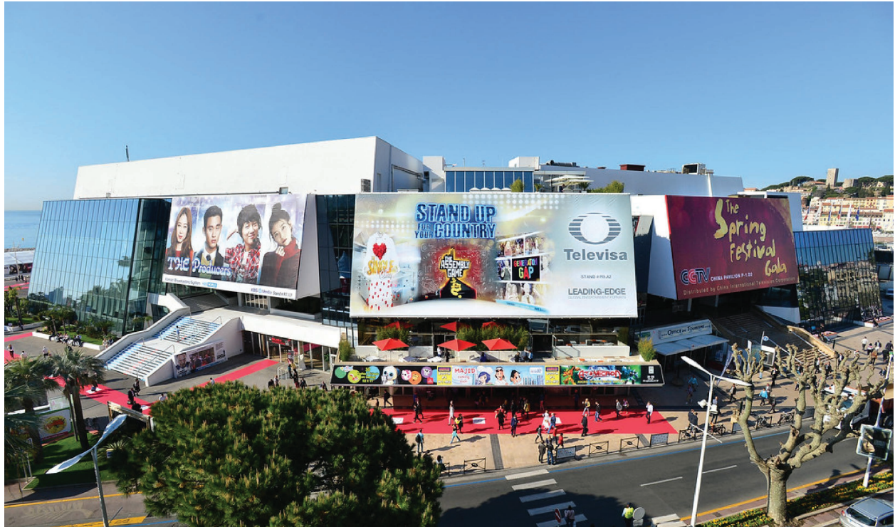
Figure 2. The entrance to the MIPDigital screenings of MIPTV in the Palais des Festivals. Photo by the author, April 13, 2015.