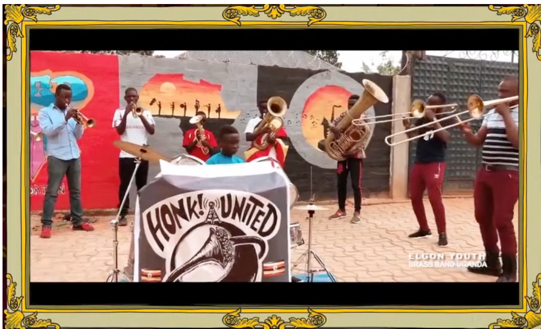
Figure 7: Screenshot of Elgon Youth Brass Band During HONK!United.