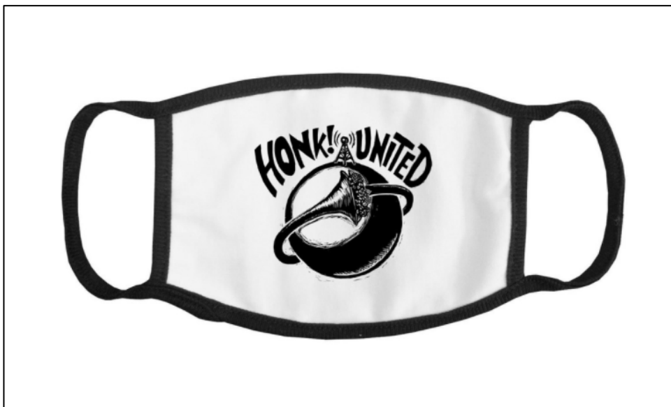
Figure 2. A HONK!United face mask available for sale.