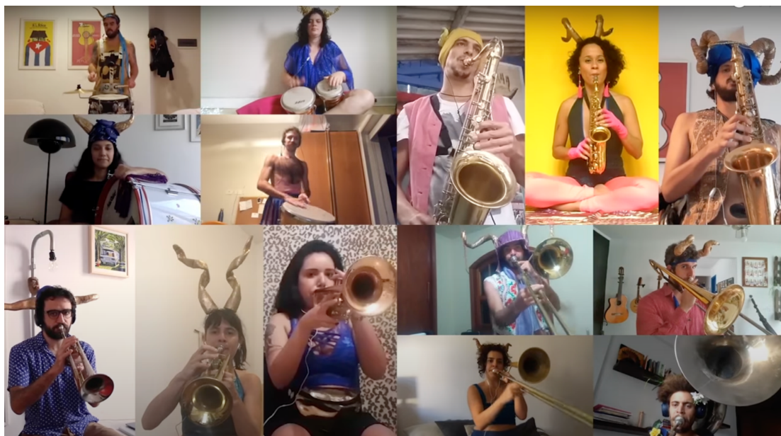
Figure 3: A COVIDeo by Cornucópia Desvairada from São Paulo.

Link: http://dx.doi.org/10.3998/mp.2337 ; https://youtu.be/WzWJNGwIxEY .