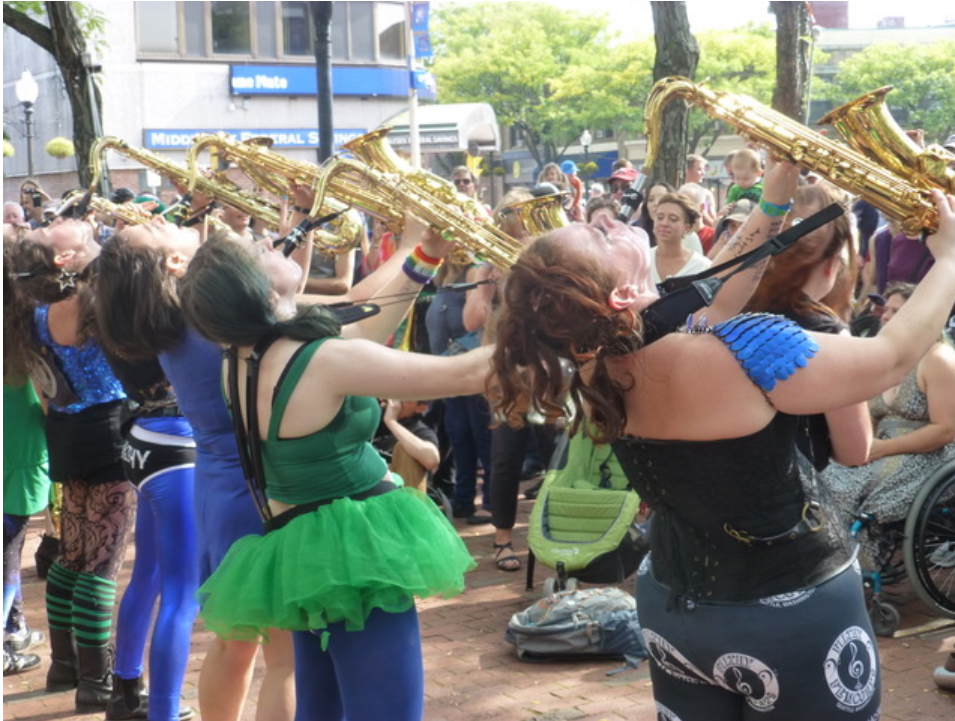
Figure 1: Seattle's Filthy Femcorps play at HONK! in Somerville, MA in 2017.

Many HONK! Festivals include educational opportunities, such as workshops or open pick-up bands available to bandless festivalgoers, as well as collaborations with activists and community organizers in support of a range of social justice issues or mutual aid initiatives, though each individual HONK! Festival focuses to differing degrees on these types of projects. Since all the bands are loud, acoustic, and mobile, there is no electricity, no sound reinforcement systems, and no gigantic speaker columns to mediate the music; no sound checks or set-ups to delay gratification; indeed, no stages anywhere to elevate the bands above the crowd, just music at street level, experienced up close and personal. Camaraderie, conviviality, and reunion between old and new friends at jam sessions, tune-shares, and afterparties last well into each night of the festivals.