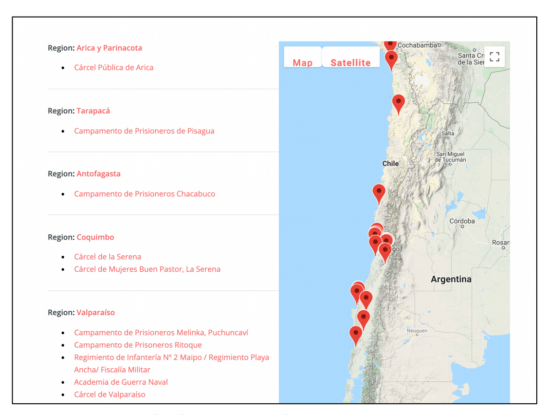
Figure 2: Screen capture of the "Detention Centers" page on the Cantos Cautivos website.

While the project does not attempt to privilege one form of testimony over another, certain criteria are required in order to submit a testimony. In addition to the contributor's name (the option exists to submit anonymously), the user provides the song title and testimony. One notable criterion on the "Submit Your Memories" page is the detention center and region in which the memory took place. The project recognizes an important geographic element to the testimonies and integrates this information in a way that facilitates wider networking and a sense of connection. With more than 1,100 centers for torture and detention, imprisonment in Chile under the Pinochet dictatorship was pursued as a veritable industry. As of May 2021, the Cantos Cautivos project has testimonies from thirty-eight detention centers in eleven of Chile's sixteen geographic regions. Many individuals were transported through multiple sites over the course of their detention, and their experiences accrued markers of the geographic regions they moved through. Visitors to the site are encouraged to explore the "Detention Centers" page, where they can move through either a set of links to pages with information about individual centers or a Google Map with pins for each of the centers.