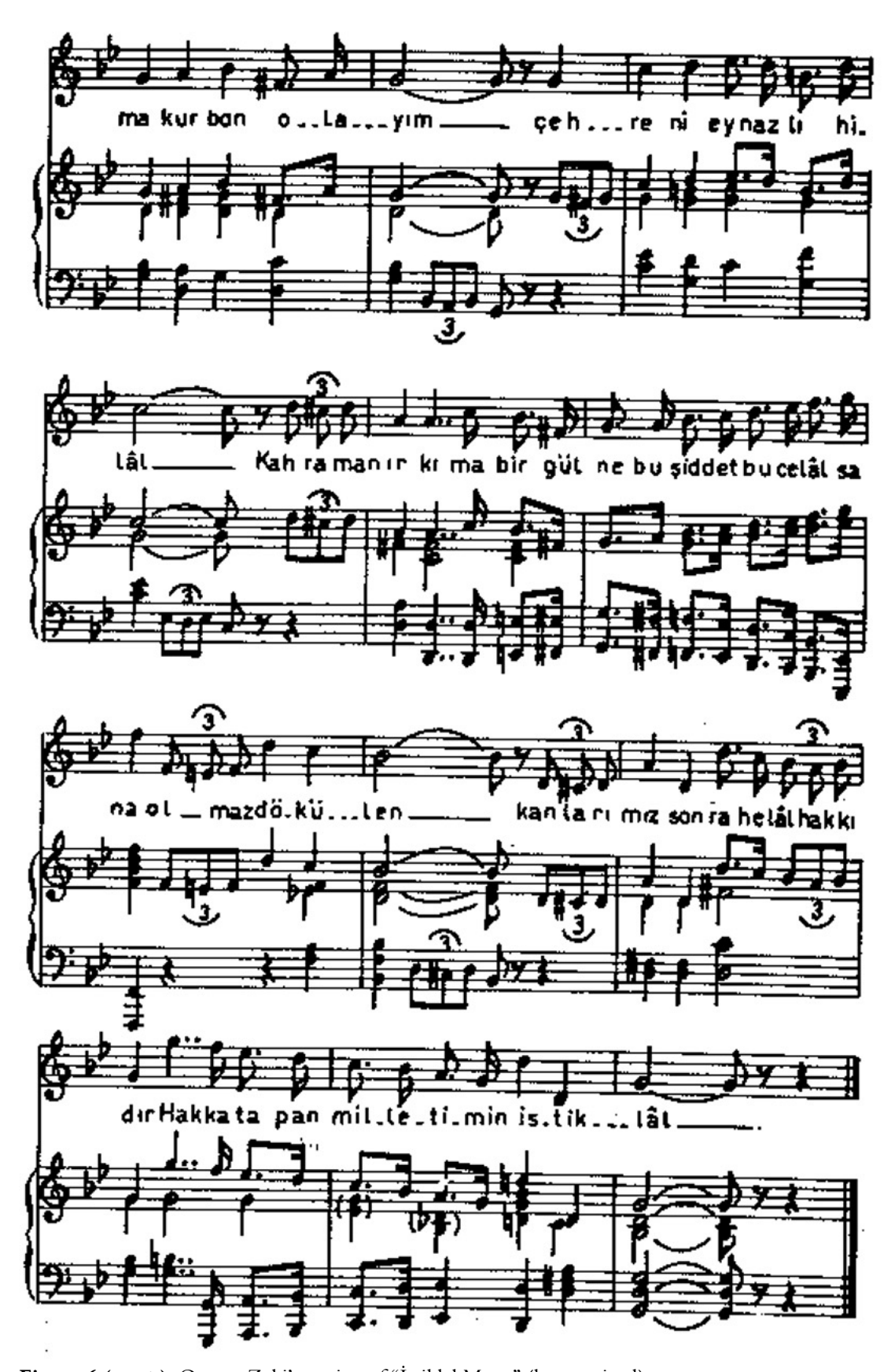
Figure 6 (cont.): Osman Zeki's setting of "İstiklal Marşı" (harmonized)