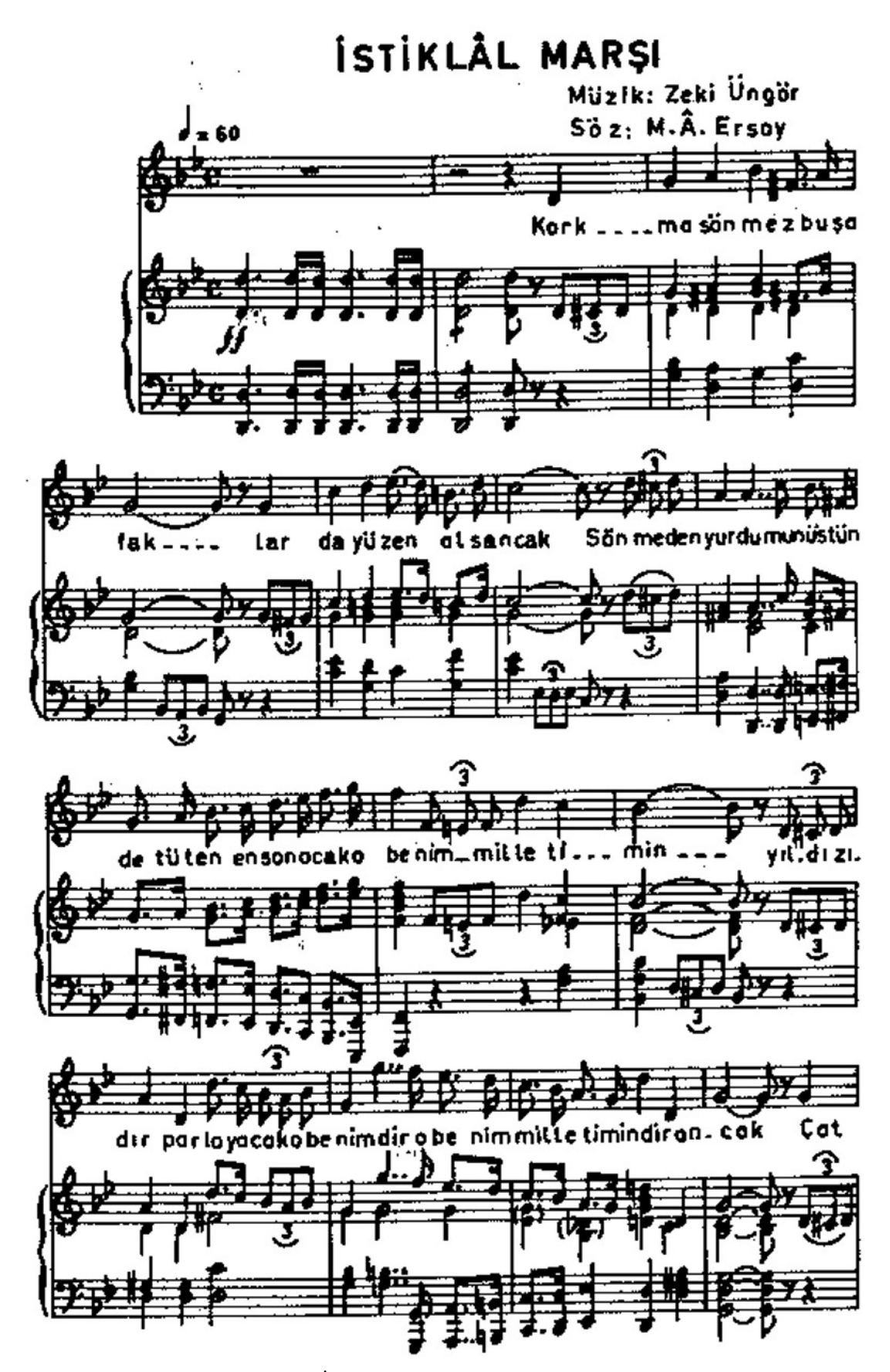
Figure 6: Osman Zeki's setting of "İstiklal Marşı" (harmonized)