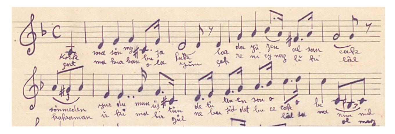
Figure 3: Excerpt from Osman Zeki's setting of "İstiklal Marşı."

An ascending scale followed by a descending octave leap which serves as a pickup for the following measure creates a separation between syllables through pitch and beat emphasis. This creates the sonic illusion of the pseudoword "obe" instead of the two words "o benim" ("that is my. . .") (see Figure 3).<sup>76</sup> Furthermore, there is an arbitrary relationship between the lengths of notes and relative lengths of syllables. According to Turkish syllable length conventions as well as the aruz of the poem, the "du" of "yurdumun" is a short foot and should not be extended as a longer foot.<sup>77</sup> However, in the second line of Osman Zeki's composition, "du" is held for the longest duration of any non-cadential note in the melody. These prosodic choices are quite telling of the fact that Osman Zeki composed the melody before setting the text.<sup>78</sup> He was therefore tasked with fitting the poem to an existing melody. This task was complicated by a melody whose first few musical sentences are four measures long, far shorter than the fourteen- or fifteen-syllable lines of the poem. Thus, it is not possible to fit the poem lines into the same space as the musical sentences without fundamentally changing the melody's rhythm.