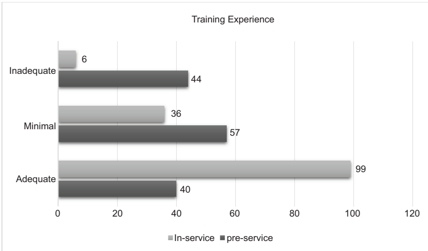
Figure 1 Training experience.