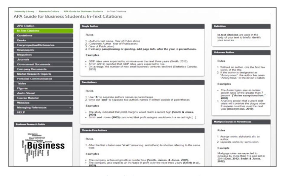
Figure 1. LibGuide for APA Business students.

Use of APA style in business writing is required throughout the degree programs in the business school, and Business 101 is the students' first introduction to it. As part of their assignments, students are required to complete and submit an academic research paper worth 15 percent of their final grade using APA. Administrators of this course had recognized and reported that the students generally perform poorly when using APA style. As a result, the former business librarian built an extensive online resource (i.e., a LibGuide on "APA for Business Students") to help undergraduate business students learn how to appropriately apply APA to their academic papers. The former business librarian invested considerable time and effort designing the guide to be user-friendly, intuitive, and accessible so students could easily find specific examples of business citations. The guide also provided a link to records of the APA Publication Manual in the University's library catalog, so students could learn where more than a dozen copies of the guide were available across the University Library system. Once this APA LibGuide was launched (Figure 1), the administrators, course instructors, and former business librarian encouraged the students to use this guide as a resource.