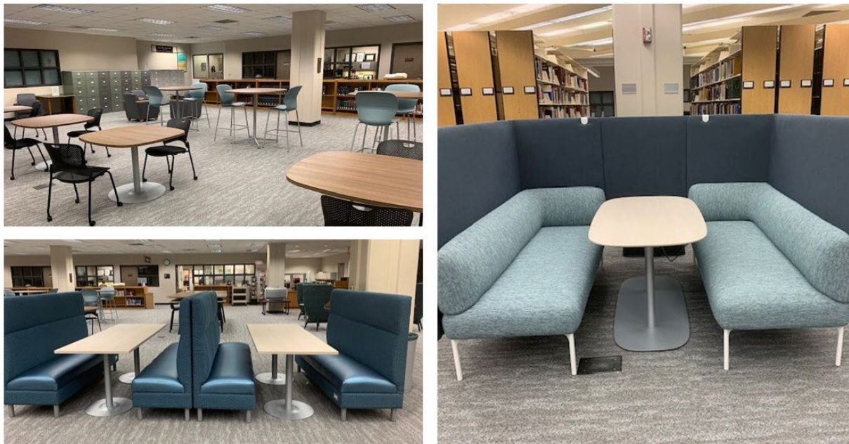
Figure 1. The Gast Business Library's renovation included new carpeting, contemporary furniture, and a new color scheme. We replaced larger tables with smaller ones (and more of them) and added café tables. The booths shown here have all proven to be extremely popular with students working in small groups.

signs, print posters or fliers), the best option to get the message out to most students seemed to be social media. Unfortunately, the Gast Business Library suspended its social media accounts just prior to the pandemic given the lack of engagement on them.