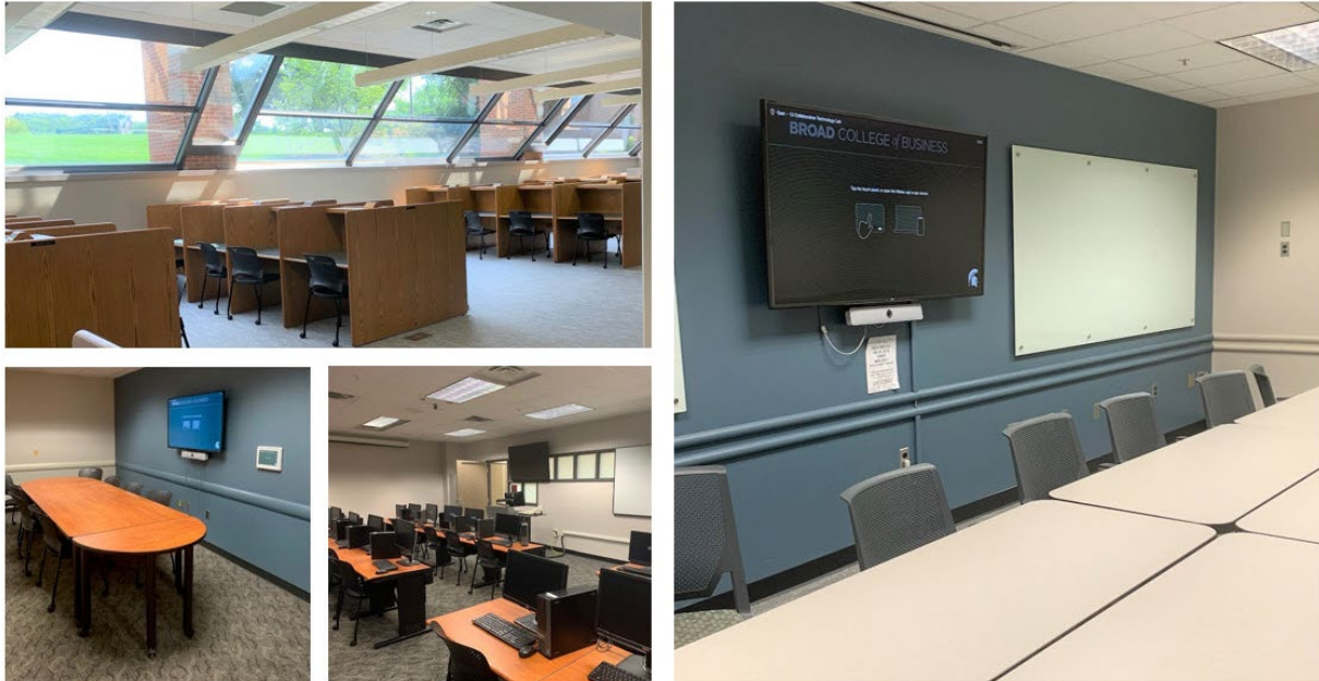
Figure 3. While we renovated most of the space, one area that we did not touch was our quiet study area, which is comprised of individual study carrels. We had also previously renovated our classroom and group rooms. The contemporary furniture and color scheme of the newer renovations were chosen to coordinate with the previously renovated spaces.