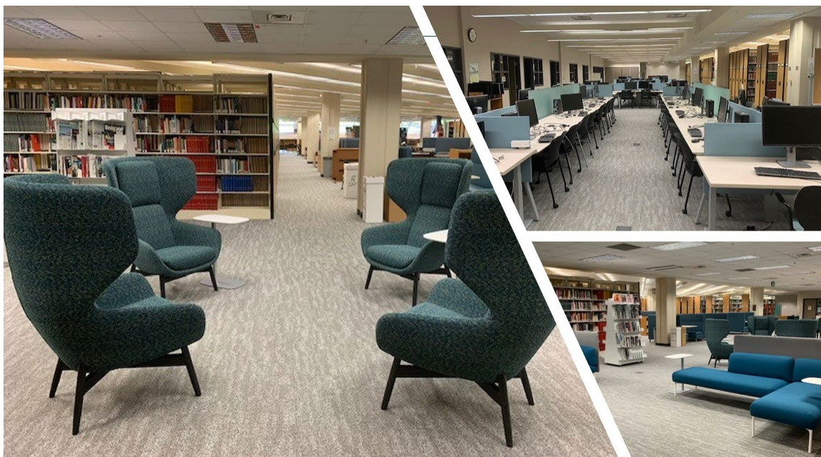
Figure 2. We also created a lounge-y feel at the front of the library that included several larger comfortable chairs, a sofa-like unit, and a smaller, more visible shelving unit for our current periodicals. The computer area was repositioned and new tables (including adjustable height desks), chairs and short privacy was added.